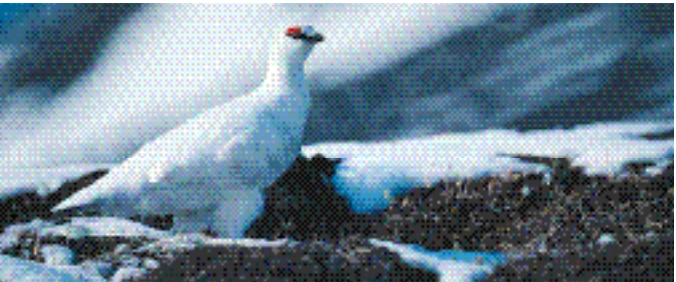
The Svalbard ptarmigan is the only sedentary bird in Svalbard.

You are allowed to bring a maximum of five kilograms of game meat when you leave Svalbard.